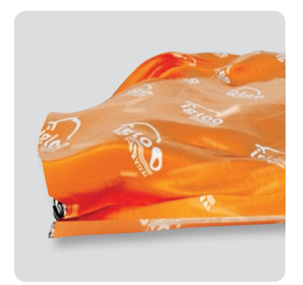
Easy to seal and reopen.